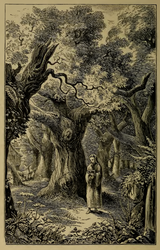
" Within a lodge out of the way, Beside a well in a forest."—Еросн Мех, Page 163