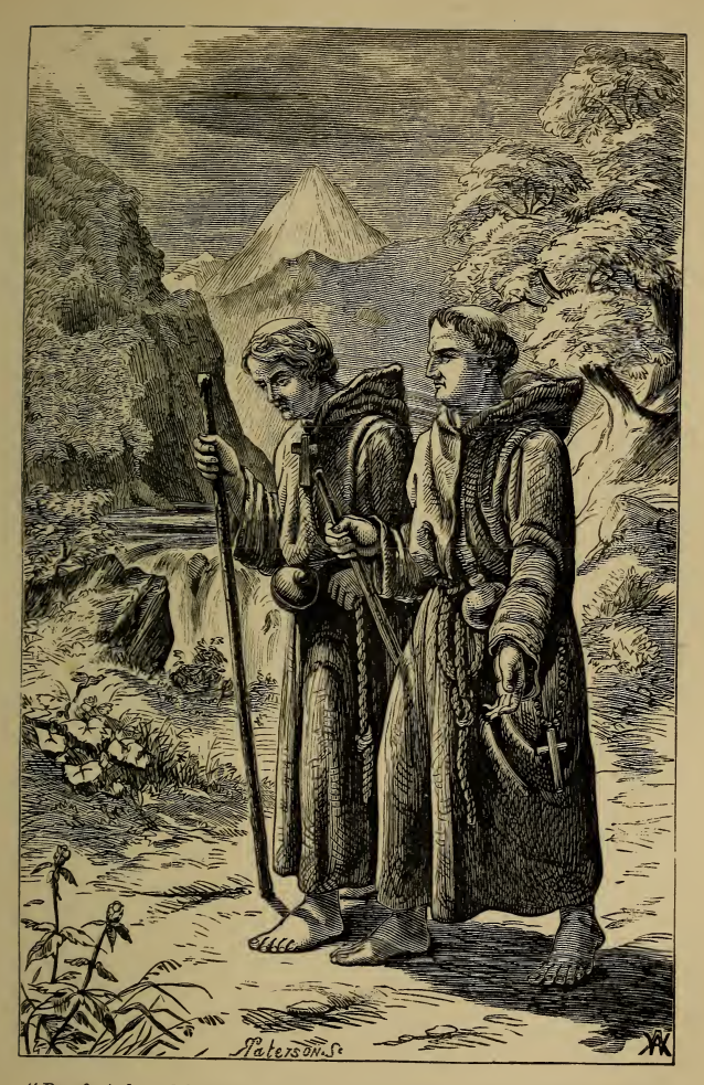
"Barefooted, and humbly clad, Leo, the shepherd of the Church, walked in modest pilgrimage to the loftiest eminence the world afforded. Hildebrand accompanied him.—Epoch Men, Page 58.