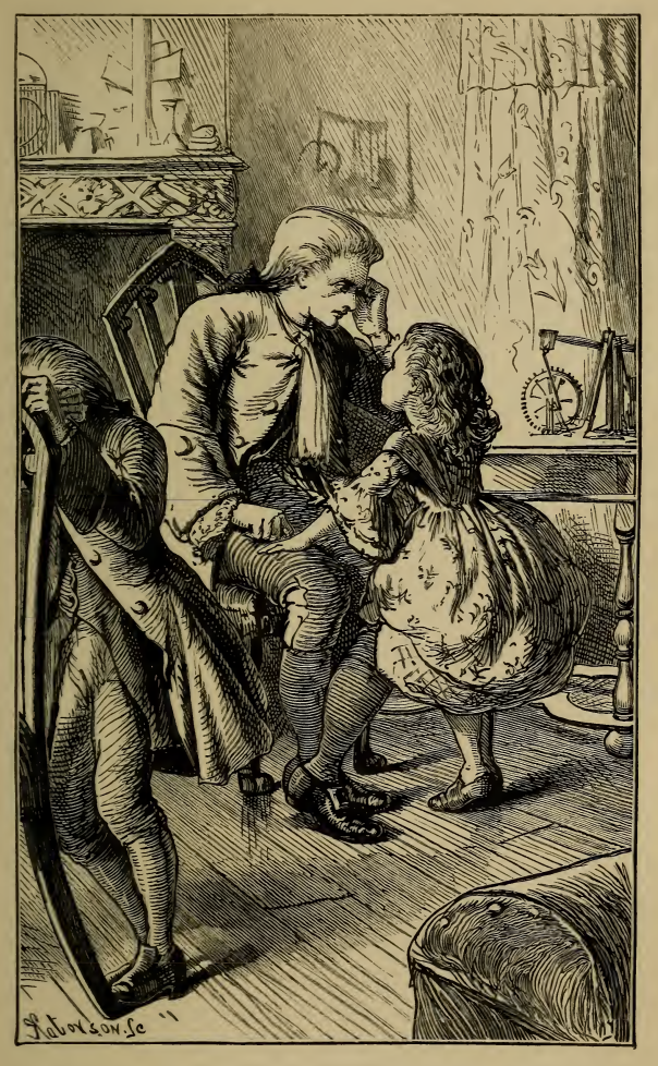
^{\prime\prime} A son and daughter survived her. The sadness of death made the miseries of life more perplexing."—EPOCH MEN, Page 800.